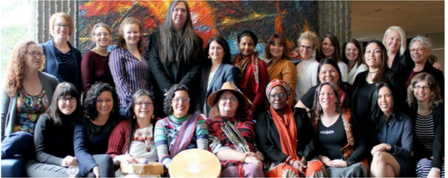
National CHIWOS Research Team at CAHR 2017, Montreal QC

The Canadian HIV Women's Sexual and Reproductive Health Cohort Study National Update